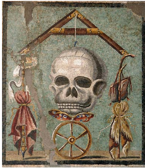
Mosaic from House with Workshops, Pompeii